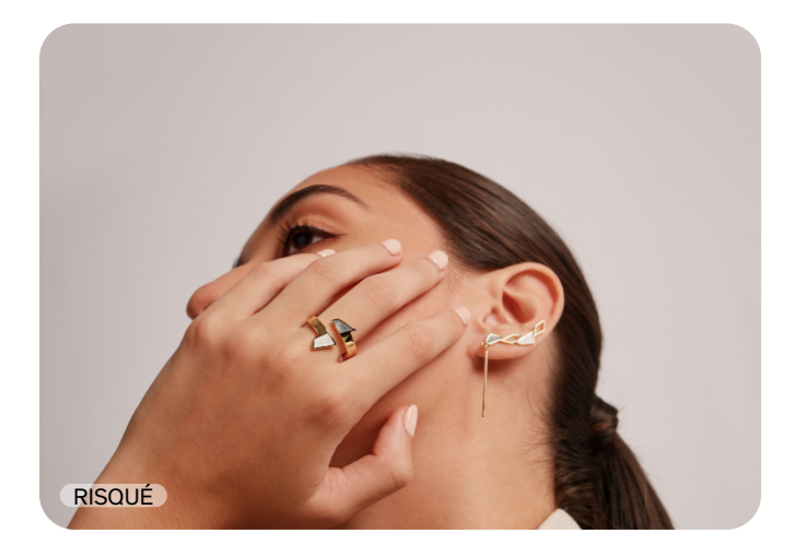
*BOCI is a professional body that brings together three major sectoral groups: Fashion Jewellery, Precious Metals and Industries Applied to Art Professions. Its mission is to act as a link between designers, manufacturers, public authorities and partners in the sector.

The January edition sees the return of historic collections that have experienced the great years of the BIJORHCA show and know how important it is to have an event in Paris that speaks to all the industry's main players.